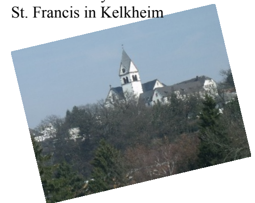
The Monastery Church of St. Francis in Kelkheim