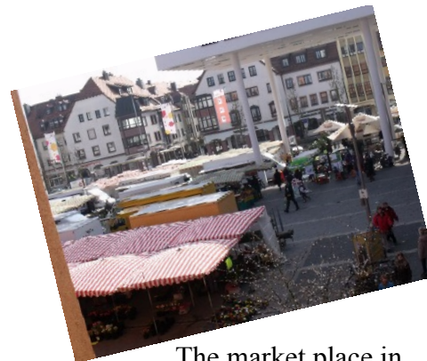
The market place in Kelkheim